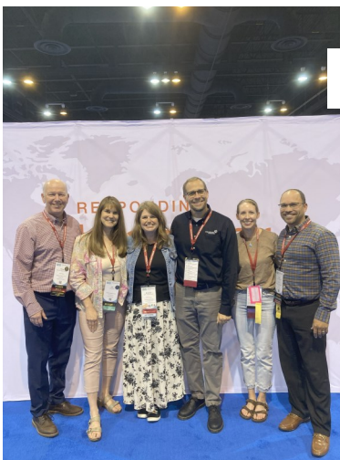
ABCUSA Mission Summit in Omaha, NE