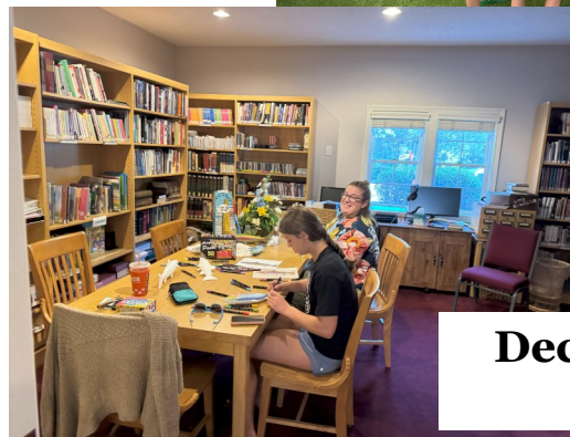
Decorating for VBS