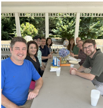
Celebrating Staff Birthdays