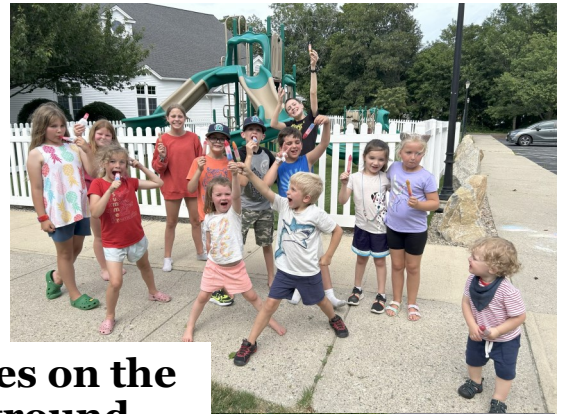
Popsicles on the Playground