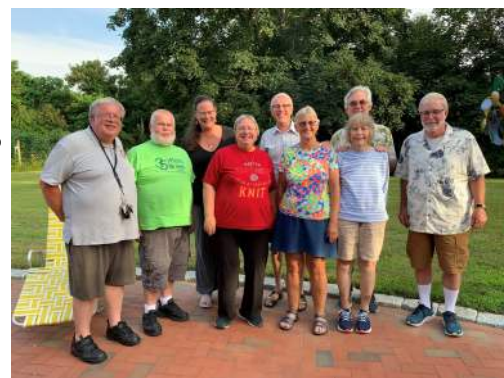
July reunion of a BBC Youth Group from the late 70s.

8/25: Were you a part of our youth group or student ministry? What was your role in that and what are some stories you have from those times?